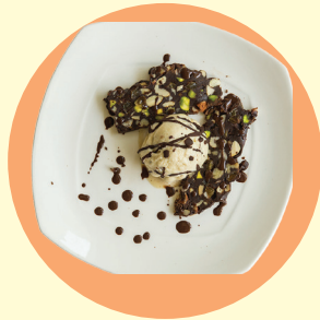
Panpepato Cake and Gelato