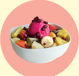
Fruit Salad with Gelato