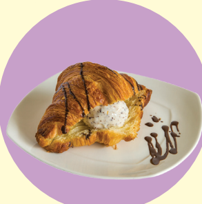
Warm Croissant with Gelato